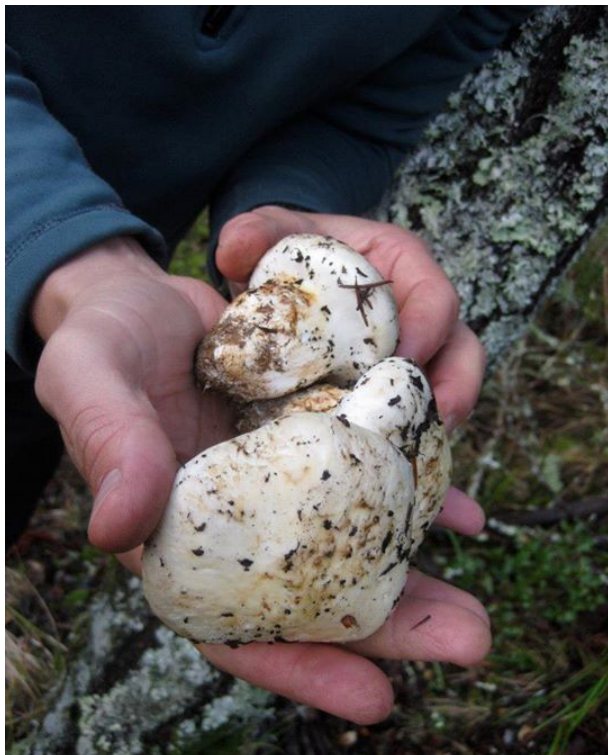
Perfect #1 button Matsutake M.Evans

Matsutake mushrooms grow at the base of trees and are usually concealed under leaf litter on the forest floor, forming a symbiotic relationship with roots of various tree species. Obviously, they do like pine trees but in our coastal areas they also associate with Tanoak/Madrone forests, having a liking for sandy soil. When foraging for this mushroom, do not mistake this for an Amanita species. Let your