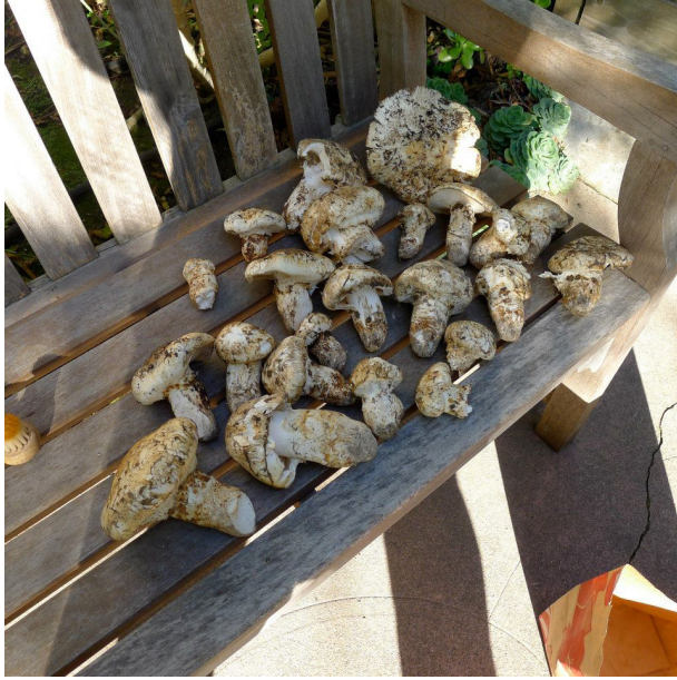
Epic harvest of Matsutake from San Mateo County M. Evans

nose be your guide but also look for distinct features such as the thick cotton-like veil and rubbery flesh. When in doubt, consult.