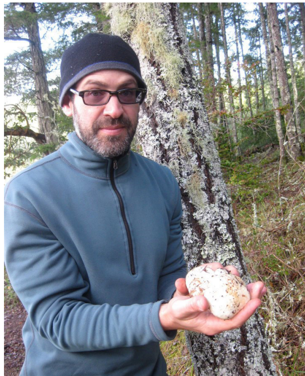
Matsutake found on Mt. Tamalpais at the base of a Douglas-Fir tree.