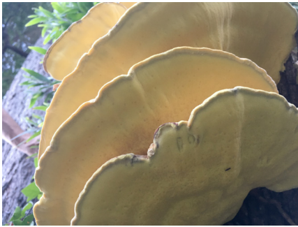
Laetiporus gilbertsonii Chicken of the Woods Oakland, CA