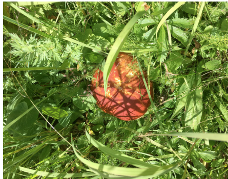
Boletus rubriceps King Bolete Telluride, CO