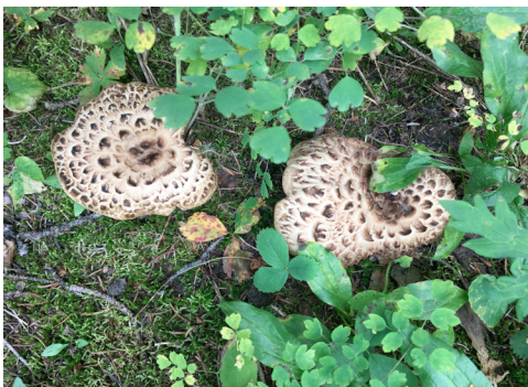
Sarcodon imbricatus Hawk Wings Telluride, CO