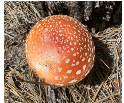
Amanita muscaria Fly Agaric Flagstaff, AZ