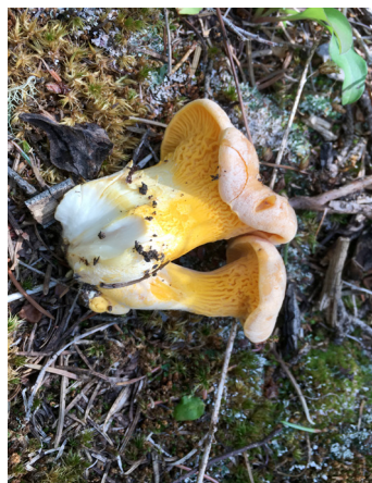
Cantharellus cibarius Golden Chanterelle Telluride, CO