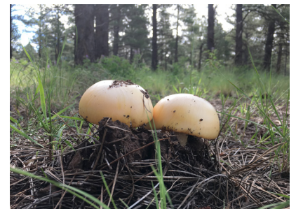
Amanita cochiseana Flagstaff, AZ