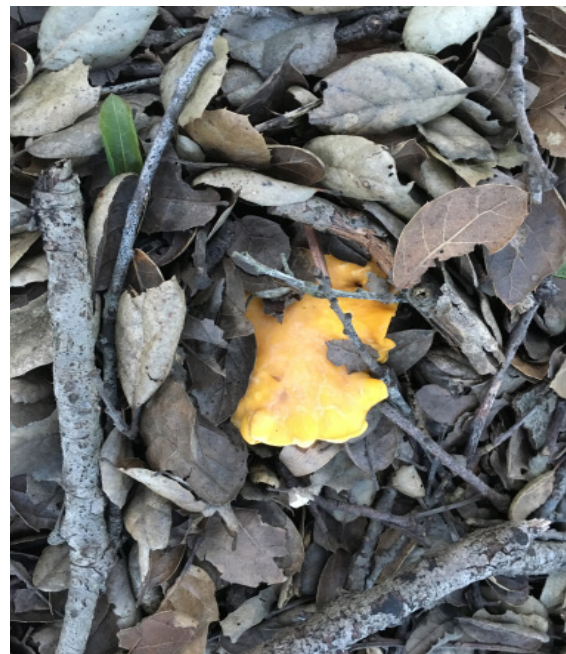
Cantharellus californicus - Oakland, CA