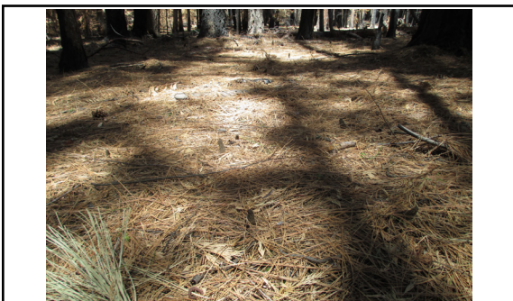
Here is a typical burn landscape with dead but unburned conifer needles mulching the forest floor. There are at least a dozen morels in the foreground of the original high res photo. Within the whole landscape area of the photo there were over fifty morels picked © Ken Litchfield