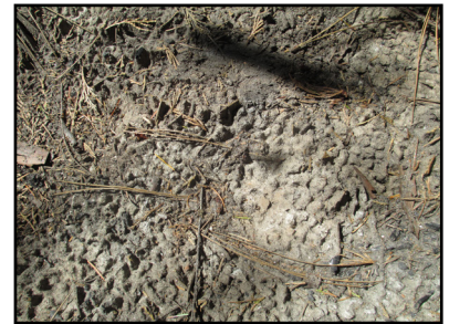
Rain drops create a morel honeycomb splash pattern in the barren ash

There are some false morel lookalikes that can be confused with true morels. These are primarily in the genus Gyromitra but could also be in Verpa or Helvella . Often these can be found right among the burn morels. These could have gyromitrins in them that could be converted into monomethylhydrazine, also known as rocket fuel. This volatile compound can be off gassed in the cooking pan where it can be dangerous to breathe, or it can off gas in the digestive tract if not cooked thoroughly. Supposedly, raw morels also have a certain amount of this in them and should never be eaten raw. As is well known, all mushrooms should always be cooked before being eaten, if for no other reason than that even the most innocuous edible mushroom has chitin in the cell walls, which, uncooked, is difficult to digest for most people. While you may be able to adapt to the chitin over time, other constituents that may be in the raw mushrooms, including morels, may not be so adaptable. And besides, most mushrooms taste way better when cooked in butter, cream, and sherry anyway. Though I myself have never had any problem with cooking and eating dried morels or with combining alcohol and morels in any form, and I don't know of anyone who has, I have encountered warnings about this online. Personally, I think these are erroneous sources, but I would be interested in reliable information about this.