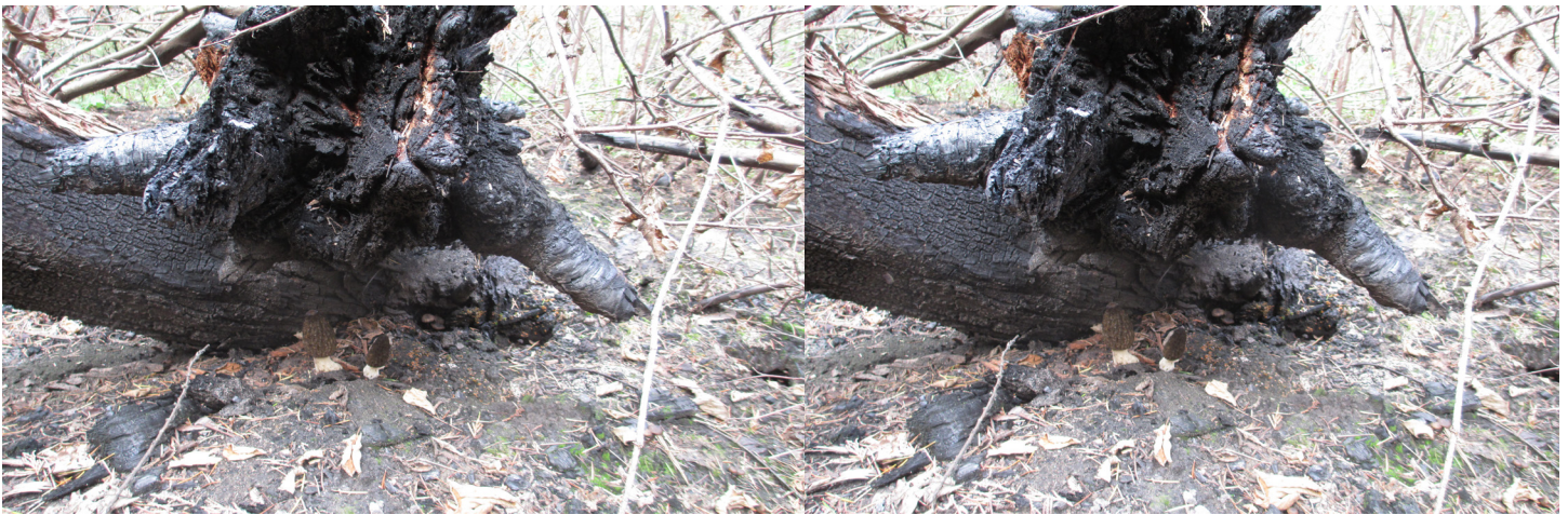
Lower Carlon, Stanislaus NF

Below are two stereographic pairs of photos. To view the 3D image that they produce, scroll the page so the images are centered on the screen. Then cross your eyes far enough to see the one pair of two images become two pairs of four images side by side. Then uncross your eyes so the middle two images become superimposed upon each other and this superimposed image will pop into 3D. You may have to cock your head back and forth gently while crosseyed to better align the 3D image.