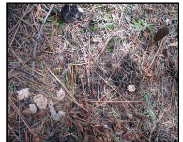
Here's several burn morel bases in situ with the tops cut showing the convolutions of the morel basal stem walls