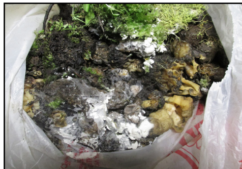
Here is a bag of burn morel bases and sclerotia a few days after harvest, sprouting and growing in the bag, before planting in the compost pile and garden mulch