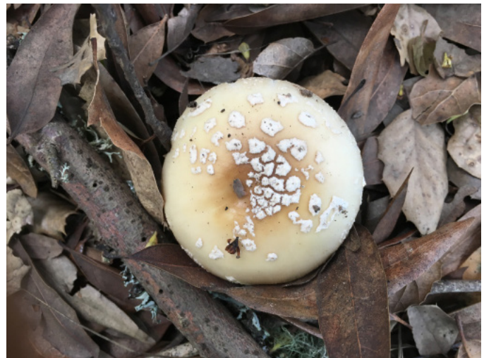
Amanita gemmata - Oakland, CA