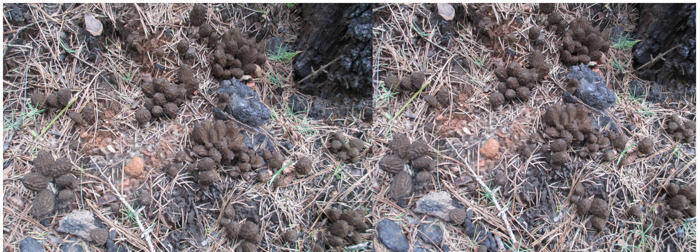
Lower Carlon, Stanislaus NF