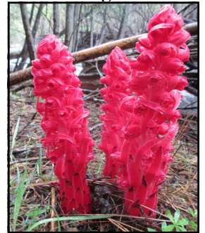
Sarcodes sanguinea , the snow plant

There is a good deal of lore that burn morellers utilize to note the spring indicators for morel fruiting at various elevations. The brilliant blood red snow plant, Sarcodes sanguinea , is in full bloom at the beginning of the morel season just as the snow melts. This achlorophyllous, blood fleshed plant attracts hummingbirds to feed on its aerial parts while its roots are parasitic on Rhizopogon fungi. When Cornus nuttallii , the Sierra dogwood, is in full bloom, that is prime morel season at those dogwoods' elevation. You can tell whether the season is early, mid, or late by the stage of the little clump of flowers in the middle of the four big, white, long lasting leaf bracts. When the central flowers are still in bud the season is early, fully open the season is high, and wilting and turning brown is late for picking morels at that elevation. The miners' lettuce is still tender and succulent but also seeding out. Any of these plant indicators for morels may possibly be found in the actual burn zone but certainly within “fingers” of unburned green forest that jut into the burn zone. Typically, the ground temperature has reached fifty degrees Fahrenheit or more as measured by inserting a spike thermometer into the ground.