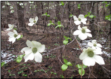
Cornus nuttallii as the snow finishes melting at Upper Carlon

Since 2010 quite a bit of taxonomic revision has been performed on Morchella , so that there could be as few as three to six species or as many as fifty to sixty species, depending upon how lumpy or splitty the researchers get. As with many other mushrooms lately, the European names apparently don't apply to what you may find in North America so we apparently don't have the delectable sounding M. deliciosa or M. esculenta .