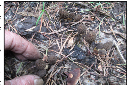
These will be ready in one week from now. Lower Carlon

There is a similar garden morel that often appears in new landscaping, generally known as the fir bark morel, which looks rounder and darker than ikeensis , but has a bit more flavor. We have often conjectured that perhaps when trees are felled in the forest they pick up dormant morel sclerotia in the fissures of the bark when they smack the ground. When the bark is rolled off the trunks before milling to lumber, the sclerotia are possibly germinating and growing in the bark piles before being distributed to soil products companies.