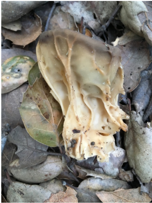
Hellvella acetabulum - Oakland, CA