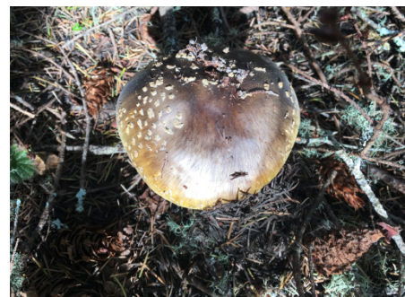
Amanita pantherina - Point Reyes, CA

Send photos of your findings to mycenanews@mssf.org to be published in the next newsletter.