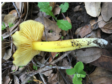
Hygrocybe flavescens - Oakland, CA