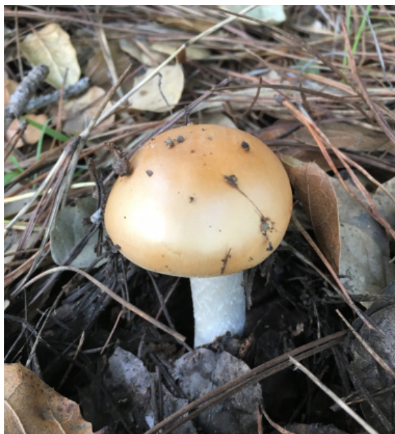
Amanita velosa - Oakland, CA