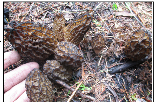
Typical find at Lower Carlon, Stanislaus NF

Morels are also stemmed and "capped" mushrooms but their