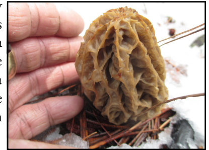
A late, spring snowfall covers already growing morels at no man's land between Stanislaus NF & Yosemite NP entrance

cap of the morel. This fertile surface area is enhanced by undulating folds that give the morel its distinctive appearance. Imagine a bowl of three to four inch long vegan breakfast sausage links, each containing eight big peas end to end, and all the sausages packed vertically side by side. Proportionally to the sausage links, the bowl might be several feet across. Then imagine the bowl being flexible like a sheet of pizza dough with the links stuck vertically to it. Then imagine pushing both surfaces of the link pizza to make undulating ridges and pits in the surface similar to a honeycomb. Then imagine pushing the whole pizza from the bottom surface up to make a hollow pointed balloon covered with sausage links and then attaching the rim of the hollow pizza, or blowing end of the balloon, to a hollow stem. When the conditions are right the sausages shoot off a cannonade of spore peas out of their opercula into the air from the outside surface of the morel, rather than dropping them from the underside of a capped and stemmed Basidiomycete.