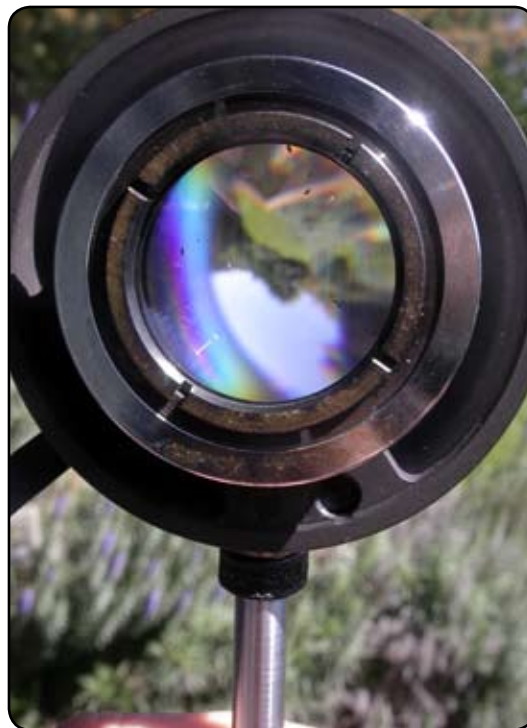
A possible replacement condenser fails to make the grade – a close examination reveals dirt between the lenses in an area not easily accessible through simple disassembly. Examine your scope components and upgrades carefully!

(Also, some clarification is needed concerning Zeiss, because during the Cold War there were actually two Carl Zeiss companies, a situation I'll explain more about in the link to my blog, provided below.)