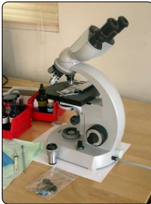
The author’s pride and joy: A Zeiss Standard 14 scope bought off of eBay, treated to some upgrades (also bought off eBay), and pressed into the service of mycological research!

Older (circa 1960s–1980s or even older) compound scopes from high-end manufacturers, like old quality cameras, hold up well over time and are the workhorses of many university mycology labs to this day. The downside of buying these is that one usually doesn’t know the history of these scopes and whether they’ve been used carefully or abused. One can buy used scopes from professional microscope dealerships with a solid maintenance history; however, one will typically pay two or three times as much for a scope from this source (probably in the $1500–2000 range) than one would from a source like eBay or Craigslist. (In some cases, eBay scopes are sold by microscope specialists who clean and refurbish the scope; this is a valuable perk in a used scope when available.) I think Köhler illumination is essential both for getting even