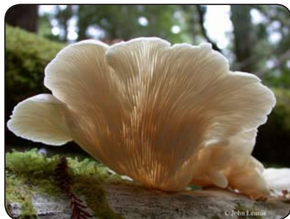
Pleurotus ostreatus fruitbodies on wood. The mycelium in the wood produces toxic drops that paralyze nematodes, which are consequently devoured by the fungus.

Oyster mushrooms and their relatives in the genus Hohenbuehelia (gilled mushrooms chockfull of thick-walled incrustated cystidia, with a gelatinous layer in the cap) have come up with a remarkable alternative—they devour nematodes. The mycelium of these species forms drops (in the case of Pleurotus ) or adhesive knobs ( Hohenbuehelia ), which contain toxins that paralyze the nematodes (which are very small worms). The reaction of a