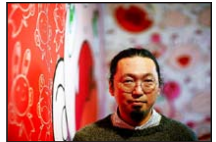
Takashi Murakami, 2007. Photo © Robert Gauthier. Courtesy of Los Angeles Times

Sources: http://www.moca.org , http://www.latimes.com , http://english.kaikaikiki.co.jp/ , http://www.wired.com