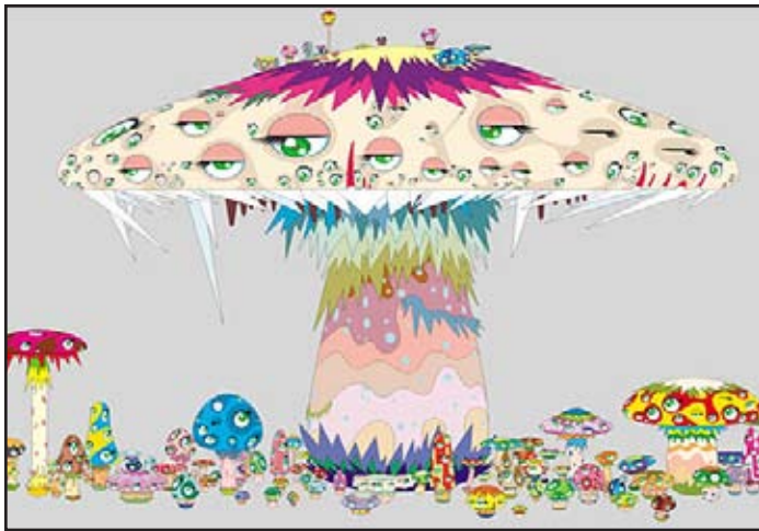
Portion of Super Nova , Acrylic on canvas mounted to board, 1999. Courtesy of Marianne Boesky Gallery

The majority of us, however, are knee deep in Bay Area duff and thirsty for a forager's cultural report. Those who think they are unfamiliar with Murakami's work need only glance at