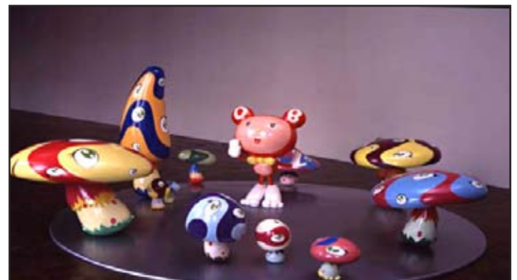
DOB in the Strange Forest (Red DOB) ; FRP, resin, fiberglass, acrylic, iron; 1999.